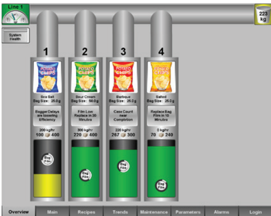
Operator screen of New Horizon Control & Information System